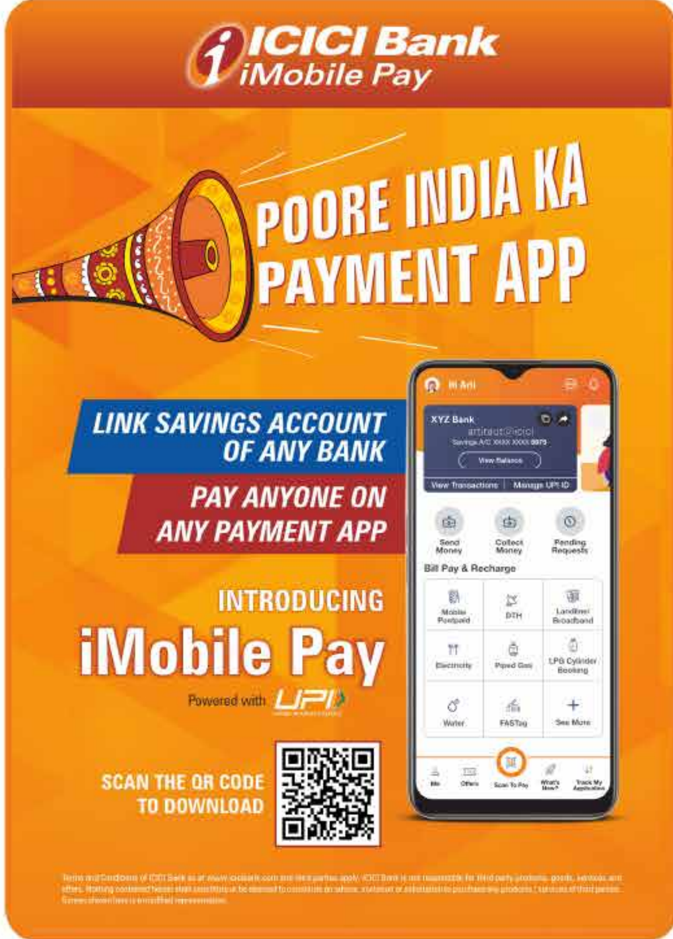
ICICI Bank iMobile Pay Newspaper Print ad