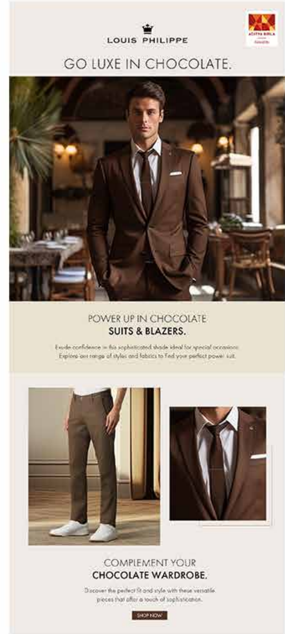
Louis Philippe Aditya Birla Fashion Emailer designs.