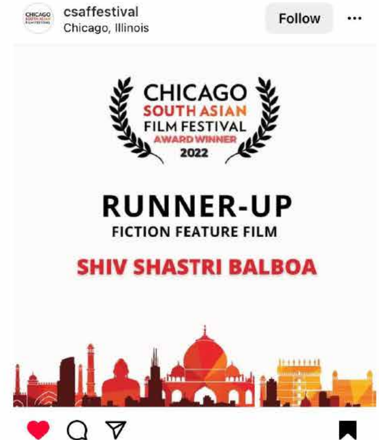
Shiv Shastri Balboa Movie Poster