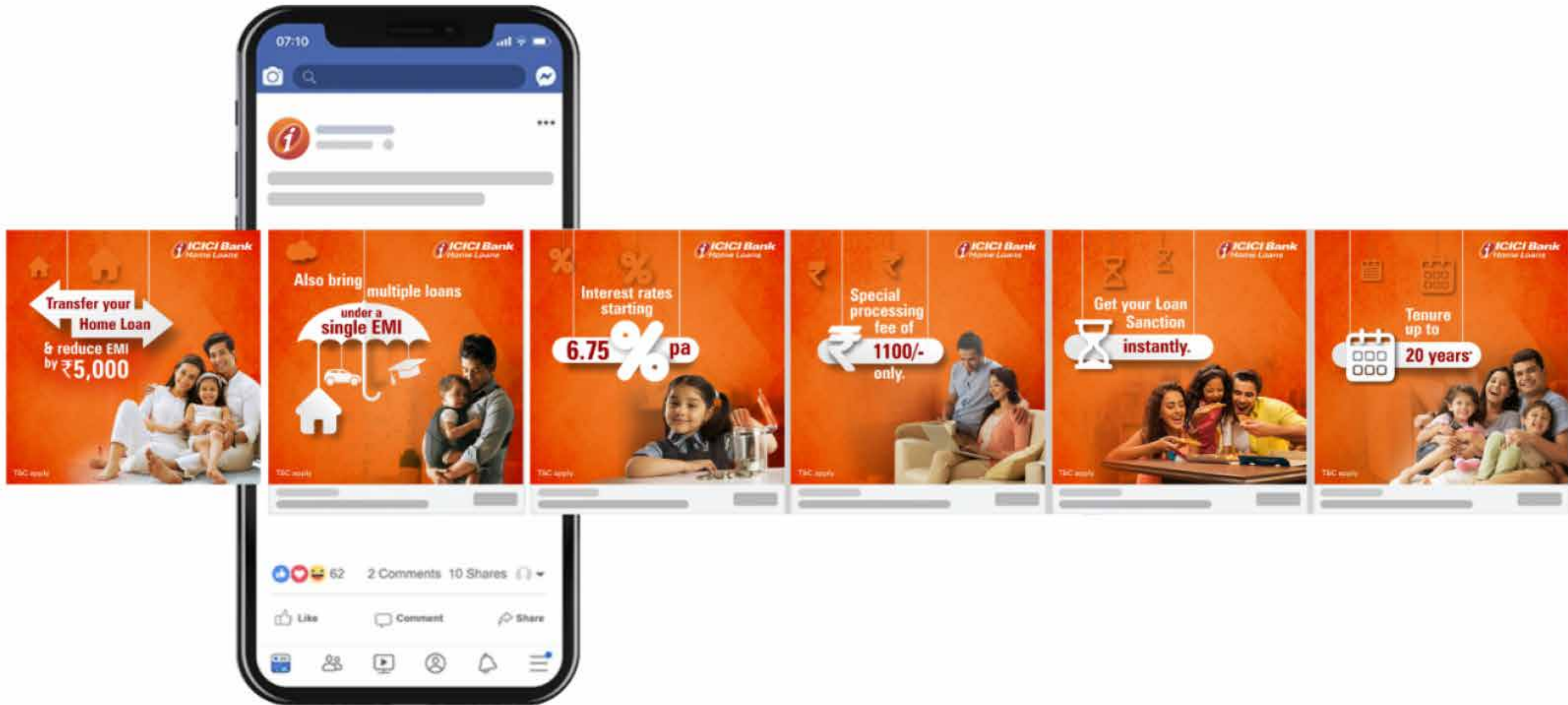
ICICI Bank Home Loans carousel ads