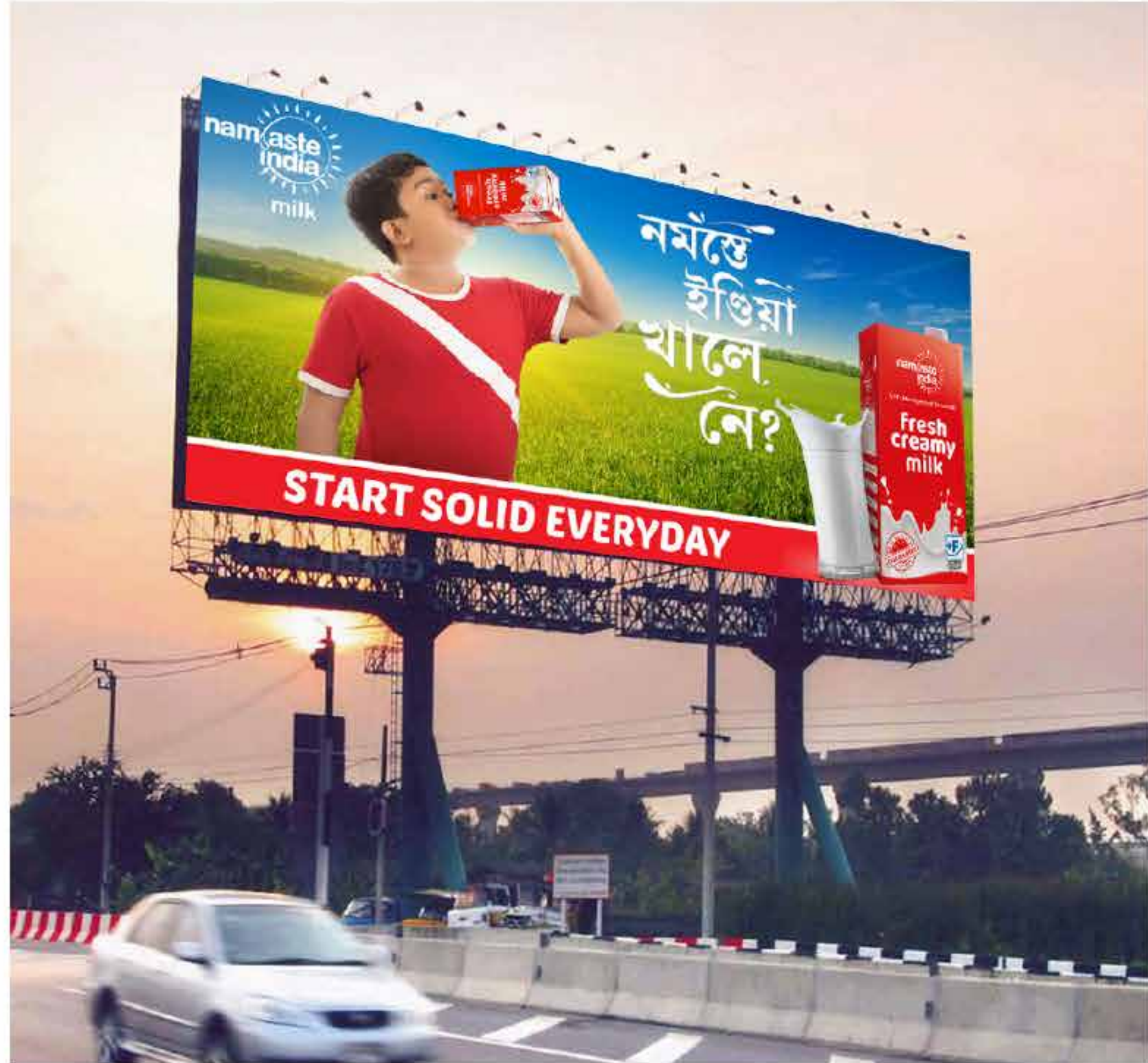
Namaste India Outdoor Creatives