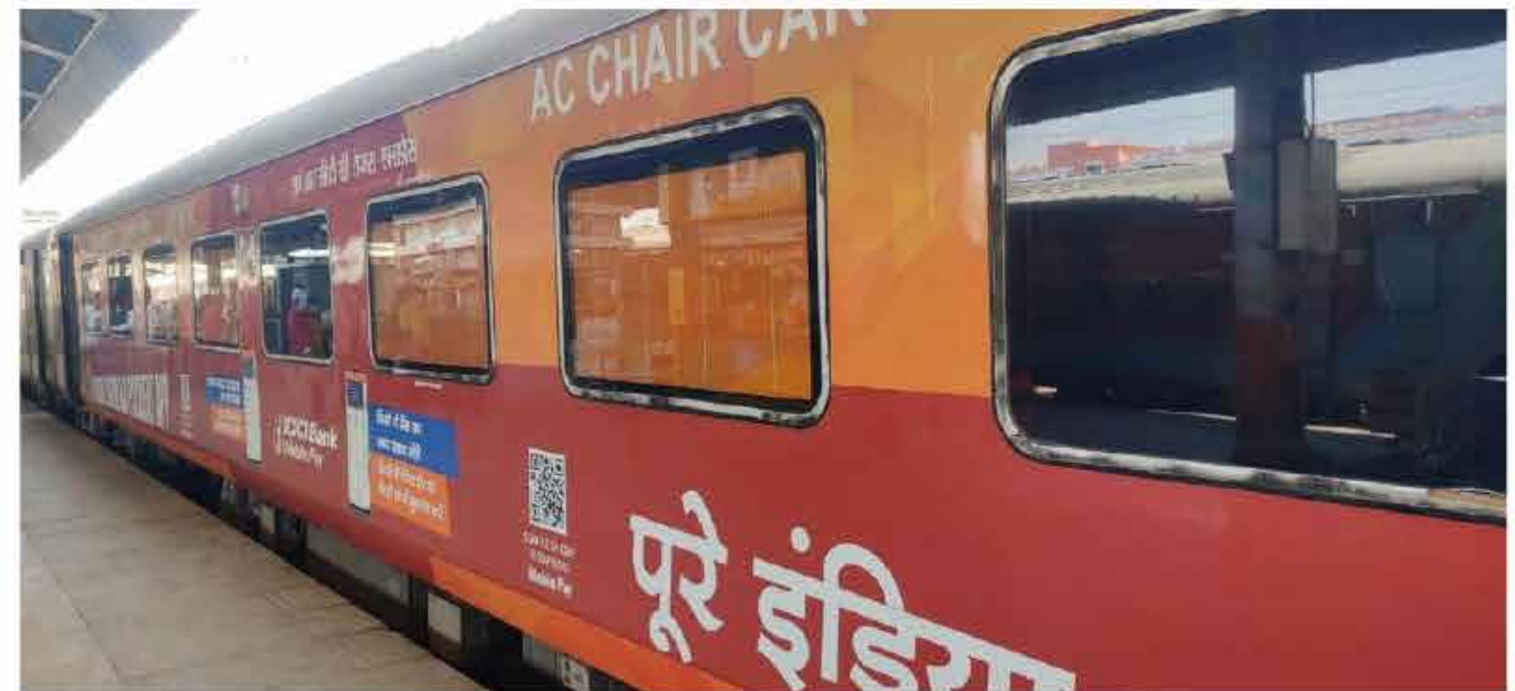
ICICI Bank iMobile Pay Tejas Express Branding