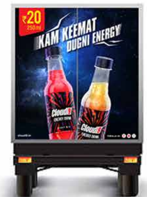
Other Branding Design Cloud 9 - Energy Drink