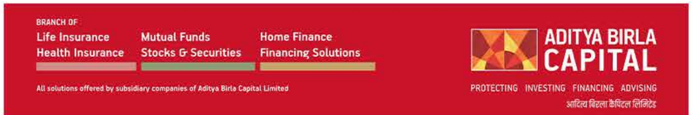
Aditya Birla Capital Branch Fascia Design